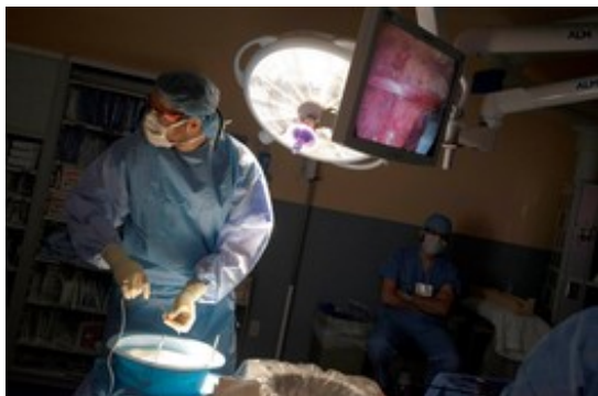
A surgeon stands next to a monitor showing a donor kidney in 2012. The average cost of a kidney transplant is $150,000. Annual cost of dialysis: $80,000

increasing the total cost of a kidney transplant.